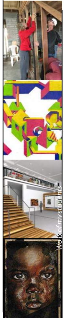
Work of my students